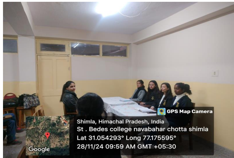
Students Participating in Mock Interview