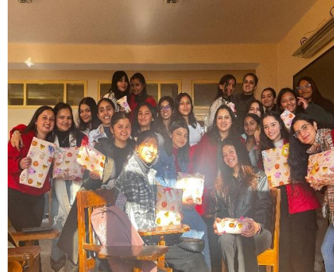
Students Exchanging Gifts