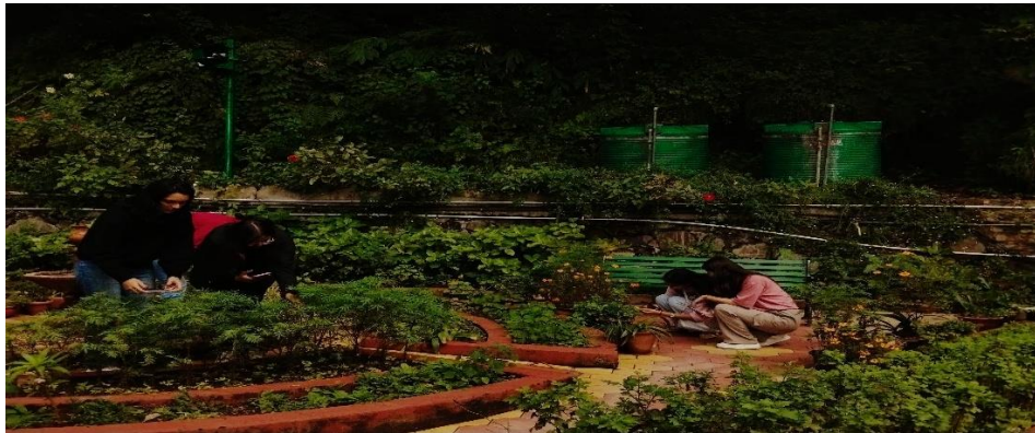
Open Air Class on Romanticism