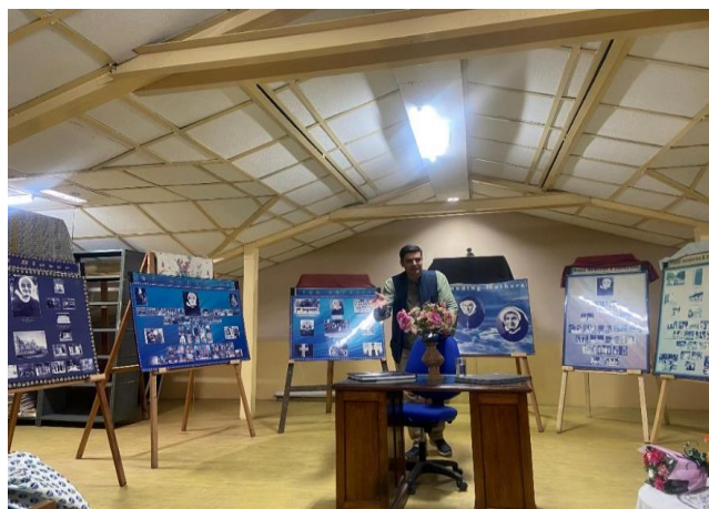
Participants of the Reading Week